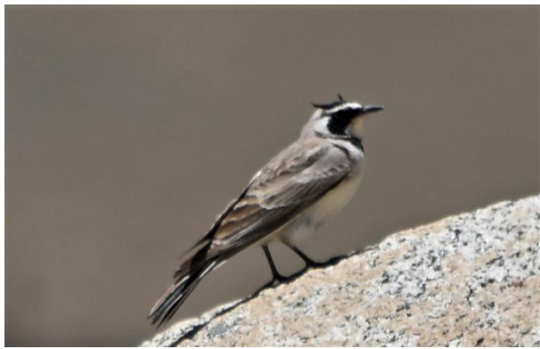
1. Horned lark