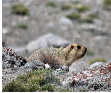
2. Himalayan Marmot