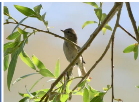
4. Mountain chiffchaff

Coordinator Zoology Department Tarucampus UOL